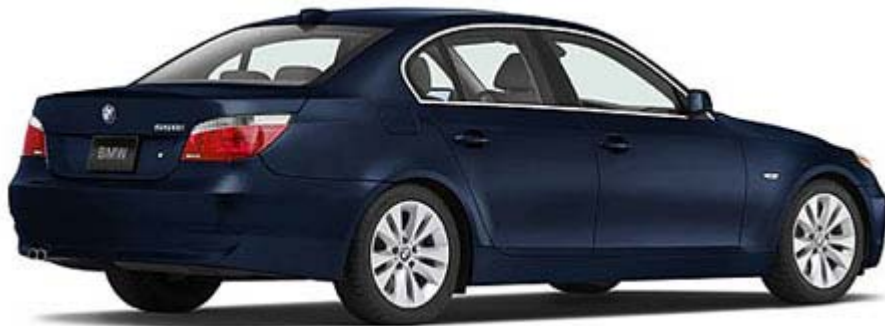
Monaco Blue Metallic