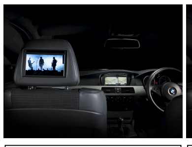
Navigation front/iPod video back

In short, using the original screen fitted to the car, you can now watch iPod video, DVD, images from reversing camera, games console, or any other visual source fitted to the vehicle. The driver will have total control over which images are displayed on which screen.