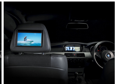
Navigation and iPod video front/ DVD back