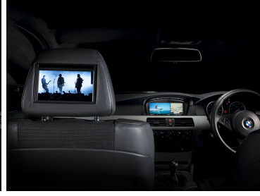
Navigation and DVD front/ iPod video back