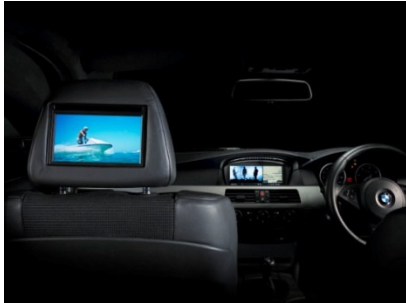
Front; Nav & iPod Rear; DVD