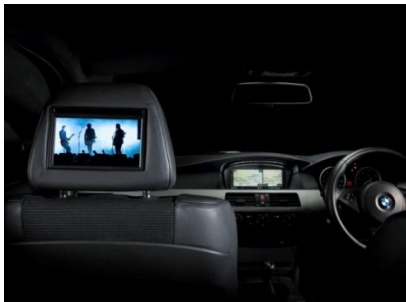
Front; Nav Rear; iPod