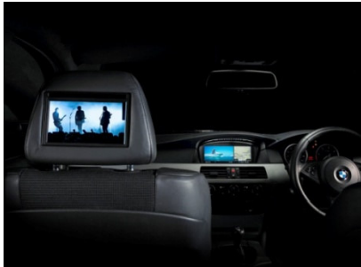
Front; Nav & DVD Rear; iPod