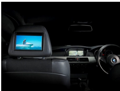
Front; Nav Rear; DVD