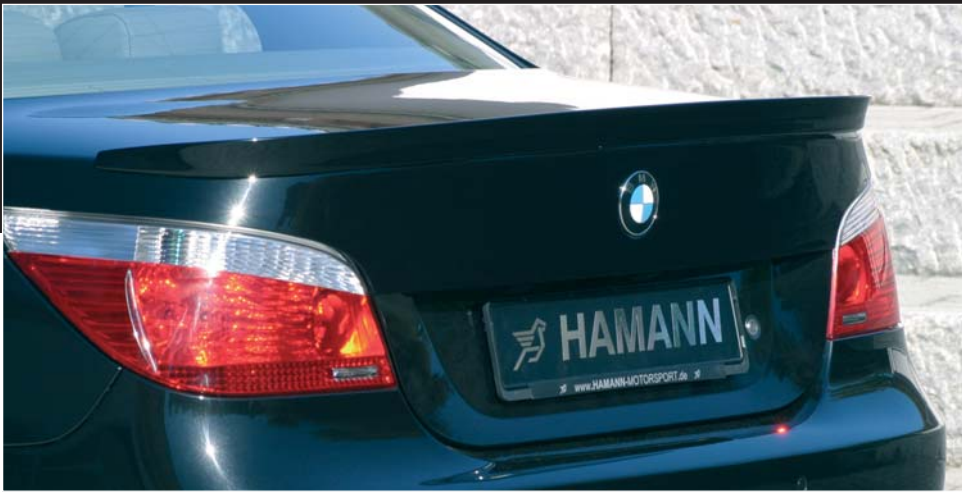
HAMANN | Rear spoiler