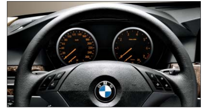
The instruments in the BMW 5 Series are located directly in the driver's field of vision. Their glare-free design ensures clear visibility at all times.