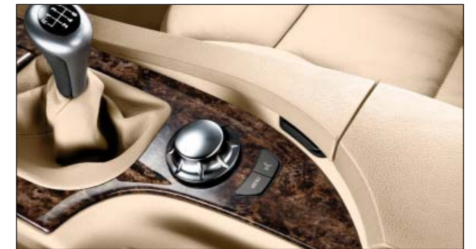
The iDrive Controller is an integral part of the overall control concept, providing easy and intuitive access to most of the comfort functions within the BMW 5 Series.

Everything is in its place. Waiting for your touch.