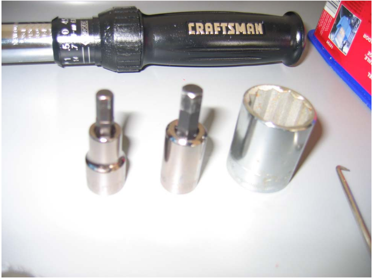
Left to right: 6mm hex socket, 8mm hex socket and 24mm socket.