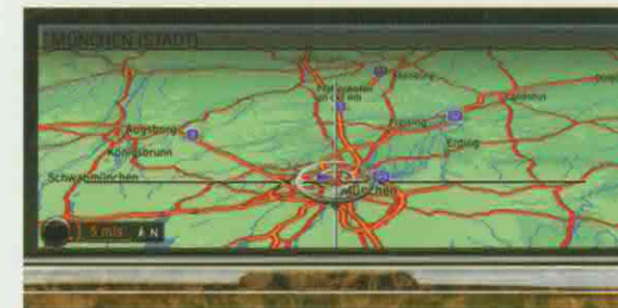
Protection for your navigation system is included with Platinum coverage.