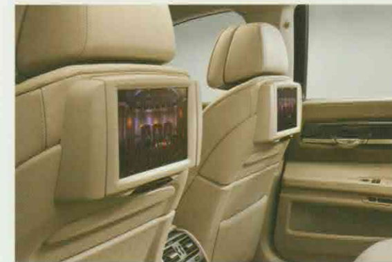
Your entertainment system is covered with Platinum Protection.

Radio, CD player/changer, entertainment system, navigation system and any components of those systems.