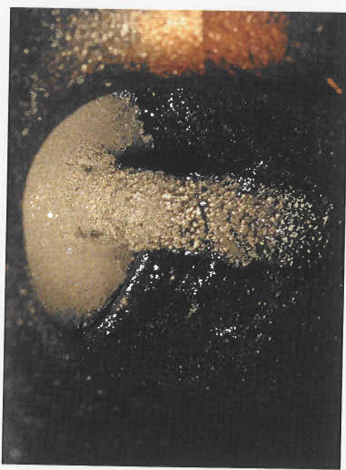
Before cleaning: Over time, even nationally known brands can leave excessive carbon deposits in the intake manifold and, especially, on the intake valves.

If you experience these symptoms, it's time to give your engine a BMW Fuel Injector and Induction System Cleaning service.