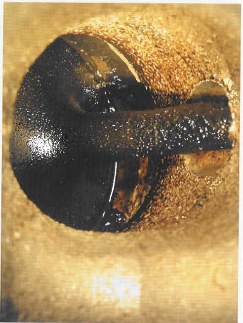
After cleaning: Your engine again achieves peak performance with greater fuel efficiency.

When you bring your BMW in for this optional service 1 , professional BMW service technicians will thoroughly clean your engine's fuel system with our exclusive, BMW-approved Fuel Injector and Induction Cleaning System with TECHRON® technology. This service quickly helps eliminate harmful carbon deposit buildup and helps restore your BMW's original fuel economy and dynamic power and acceleration.