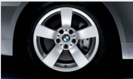
■ 17 x 8.0 Star Spoke (Styling 122) cast alloy wheels and 245/45R-17 run-flat performance tires. 1 (included in 525i Sport Package; tires not recommended for winter use in ice and snow. Spare is a space-saver wheel and tire)