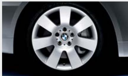
■ 18 x 8.0 Star Spoke (Styling 123) cast alloy wheels and 245/40R-18 run-flat performance tires. 1 (included in 530i Sport Package; tires not recommended for winter use in ice and snow. Spare is a space-saver wheel and tire)