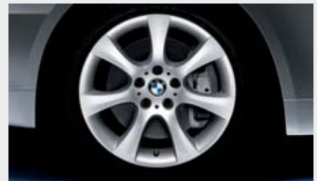
■ 18 x 8.0 front, 18 x 9.0 rear Star Spoke (Styling 124) cast alloy wheels and 245/40R-18 front, 275/35R-18 rear run-flat performance tires. 1 (std. 545i 6-speed; included in 545i Sport Package; tires not recommended for winter use in ice and snow. Spare is a space-saver wheel and tire)

■ Standard equipment □ Optional equipment