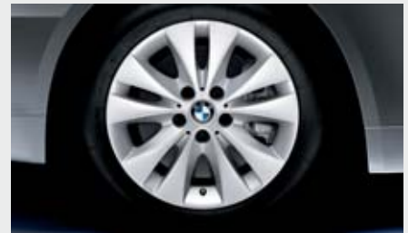
■ 17 x 7.5 Double Spoke (Styling 116) cast alloy wheels and 225/50R-17 all-season tires. (std. 545i; spare is a space-saver wheel and tire)