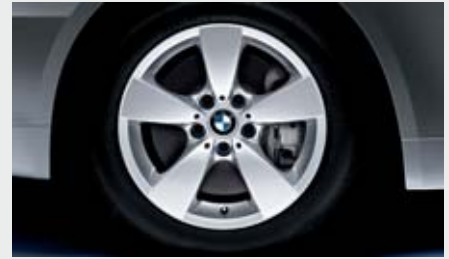
■ 17 x 7.5 Star Spoke (Styling 138) cast alloy wheels and 225/50R-17 all-season tires. (std. 530i; spare is a space-saver wheel and tire)