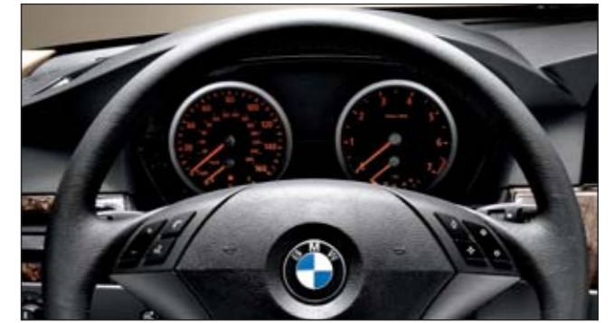
Primary gauges are recessed under a cowl, and designed for glare-free vision during the day. At night, the gauges glow in a color that is restful on the eyes.