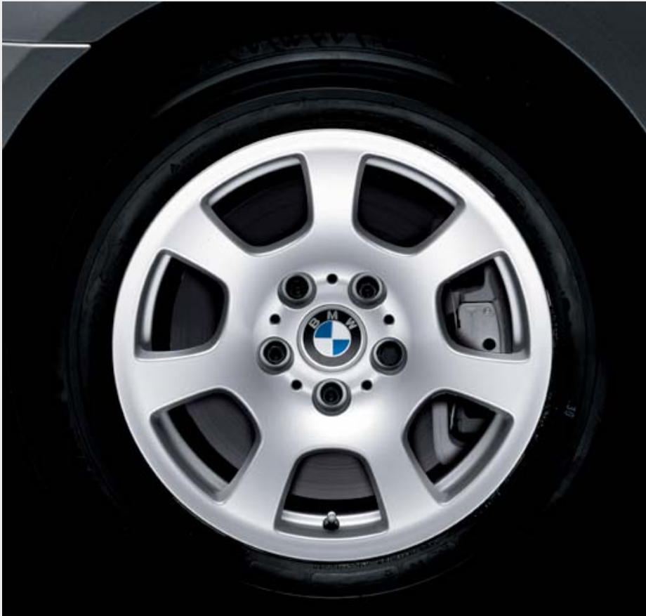
■ 16 x 7.0 Trapezoid (Styling 134) cast alloy wheels and 225/55R-16 all-season tires. (std. 525i; spare is a space-saver wheel and tire)