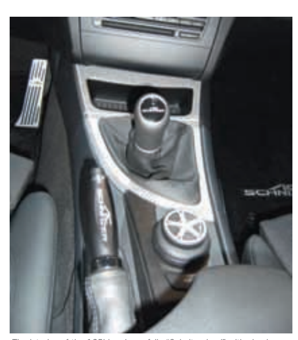
The interior of the 135i has been fully "Schnitzerized" with aluminum pedals, floor mats, silver carbon-fiber trim. Blackline e-brake handle and iDrive cover, and a new shift knob/boot combination in leather with chrome trim and an illuminated AC Schnitzer logo on the top.