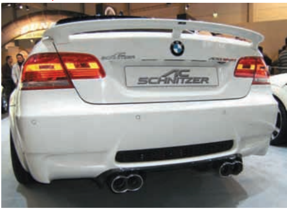
For the rear of the M3, the designers at AC Schnitzer have created a beautiful rear apron and diffuser that include references to the "flame surfacing" used on BMW's newer models. The rear wing is strong but not excessive, while the twin, "Racing" chrome tips leave no doubt as to the power that lies within this beast.