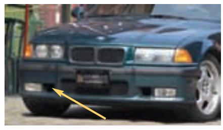
Passenger's side brake duct: 3 series 92 thru 98.