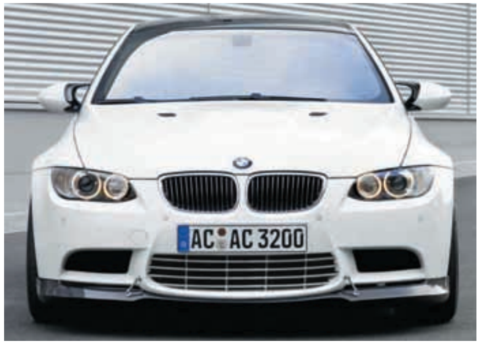
We couldn't get a decent shot of the front of the M3 at the show because there was almost always a crowd in front of it, as well as a stanchion and rope, so we've included an official press shot from AC Schnitzer. Believe us, none of these pictures convey just how impressive this car is in person.