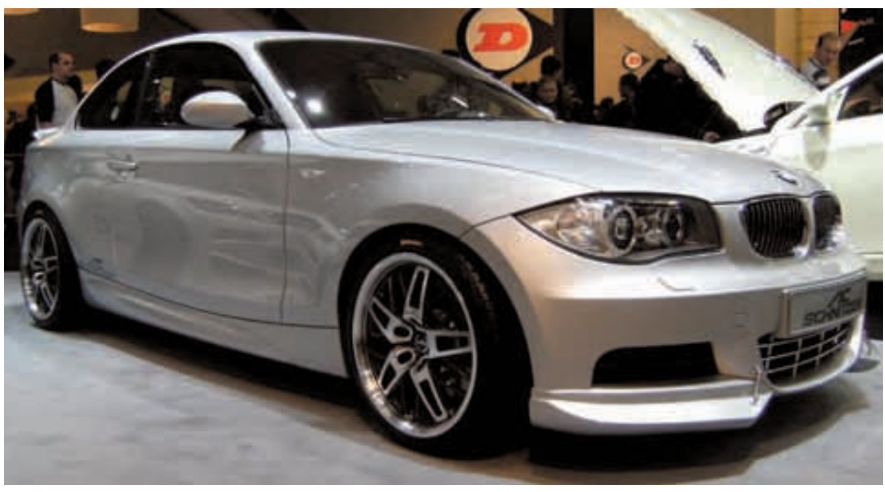
AC Schnitzer's ACS1 3.5i, based on the stock 135i with M-Technic styling, features a front grill, front lip spoilers with stabilizers and 18" Type VI wheels.

Aachen is less than an hour from Essen, so naturally the folks at Schnitzer often choose the Essen Motor Show to debut their latest creations. This year was no different: we saw the ACS1 3.5i (their version of the new 135i coupe), ACS3 Sport (the Schnitzerized M3) and world-record setting, gas-powered Concept Car. (When Germans say "gas" they mean liquid propane gas, not gasoline, which they refer to as benzene.) And even though the 1 series and M3 won't be available here in North America for a few more months, we thought you'd like to see what the folks at Schnitzer have waiting for the lucky ones among you who will be the first to own these new Bimmer models. So in between prolonged moments of staring off into space from jet-lag, elbowing through the crowds and snarfing down "würsten und pils," our intrepid reporters found enough time to snap a few pictures, which we share with you here. (For availability dates and pricing information on the products shown here, please give us a call.) Enjoy!