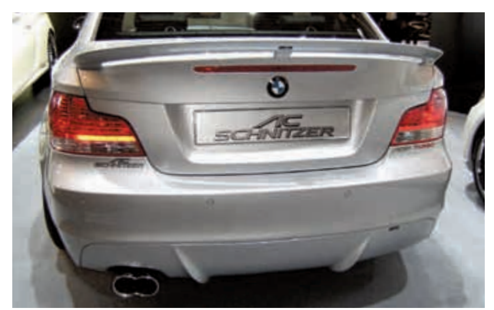
The back of the ACS1 3.5i features a rear skirt insert, rear wing and sport exhaust with the new "Racing" chrome tip.