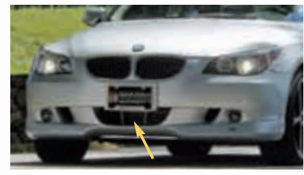
Inside lower center grill opening: 3 series 06 on, 5 series 04 on, 6 series 03 on, 7 series 02 on.