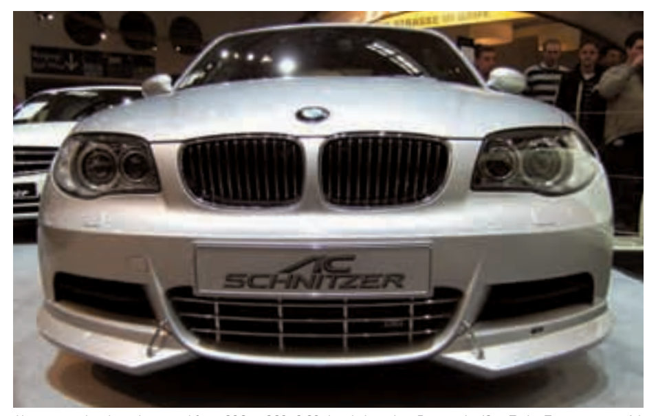
Horsepower has been increased from 306 to 360; 0-60 time is less than 5 seconds. (See Turbo Tuner on page 1.)