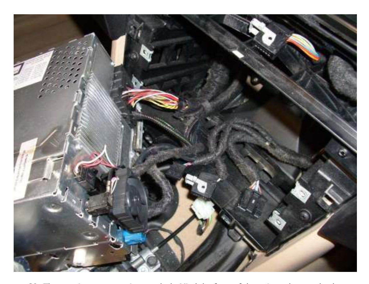
39. The massive connector is a camlock. Mind the front of the unit on the gear knob.