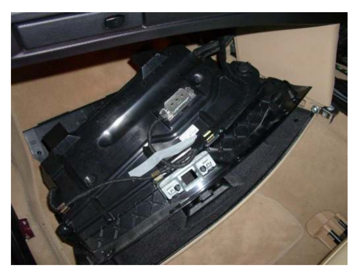
46. Disconnect all the plugs and unclip the wiring. Note that one is fibre optic so handle it carefully.