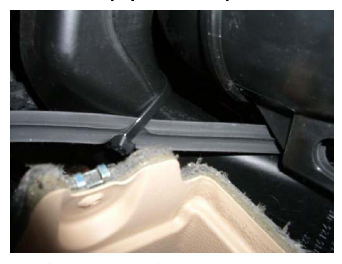
55. Right duct out. Comes out front hole better.