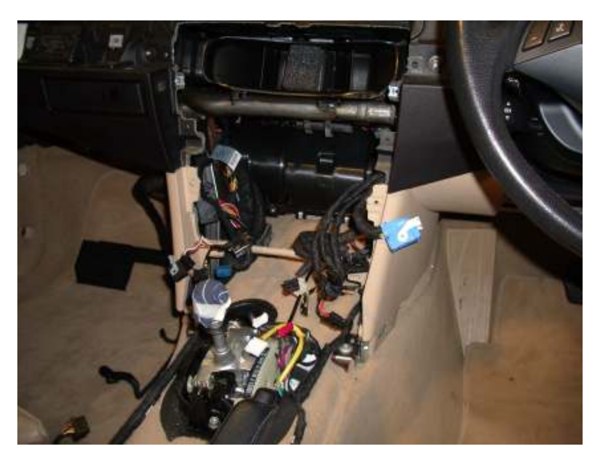
Now put it all back together. Stick to reverse order. I deviated and then had to back track because the order is important in most cases.