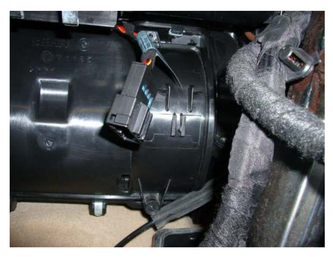
54. Cut a cable tie holding the gear selector cable to the right duct.