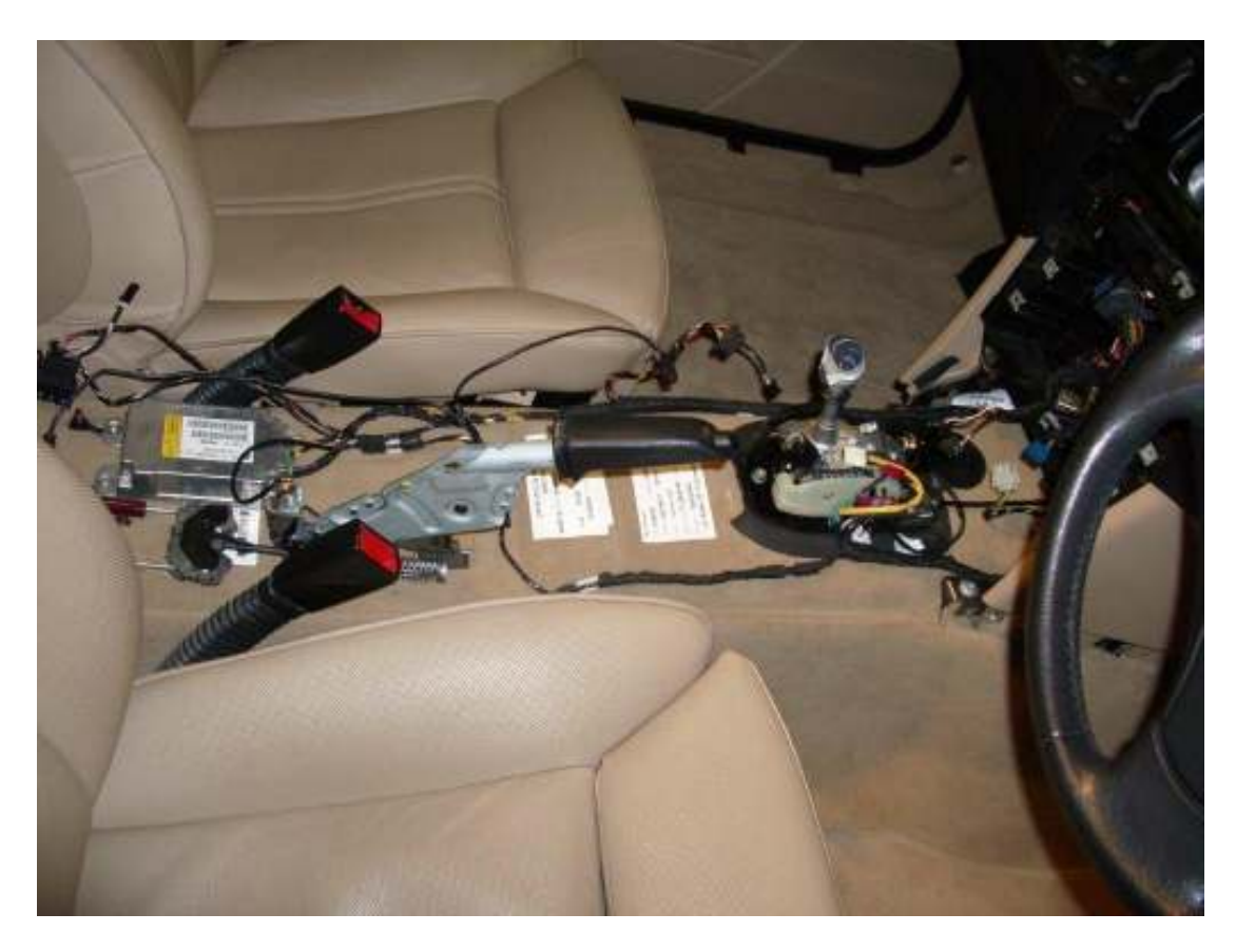
48. Central dash frame out. 6 screws. Photo the wire layout and plug positions first.