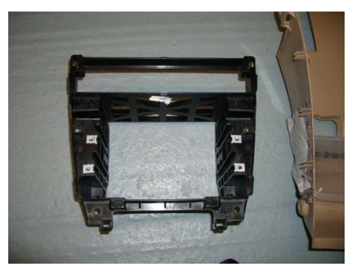
49. Cold air sensor out, turn 90 degrees and pull down.