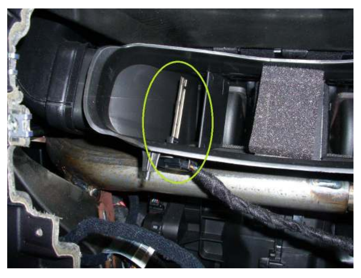
50. Central duct out. Disconnect 2 electrical connectors . Release 2 spring clips - press in to reduce the tension at the bottom then pop off the bottom with screwdriver.