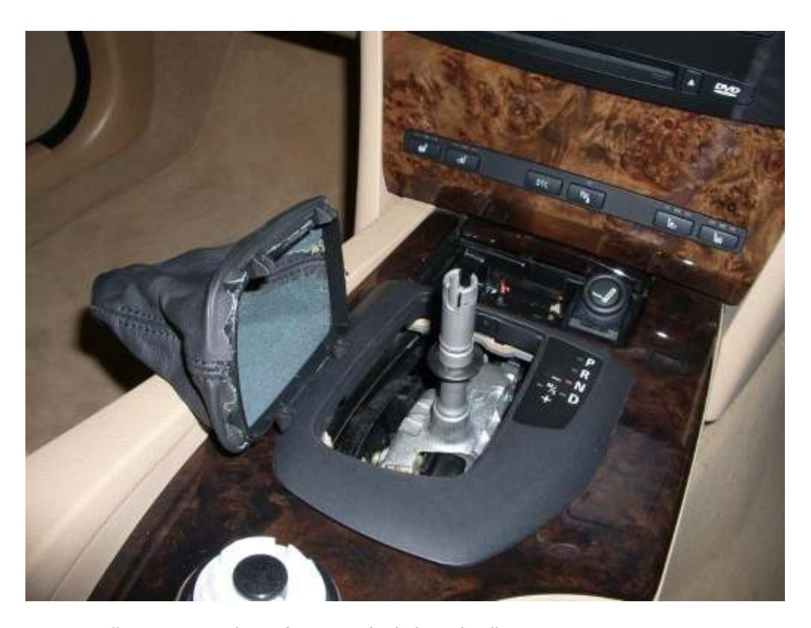
18. Pull gear surround out, fingers in the hole and pull up.