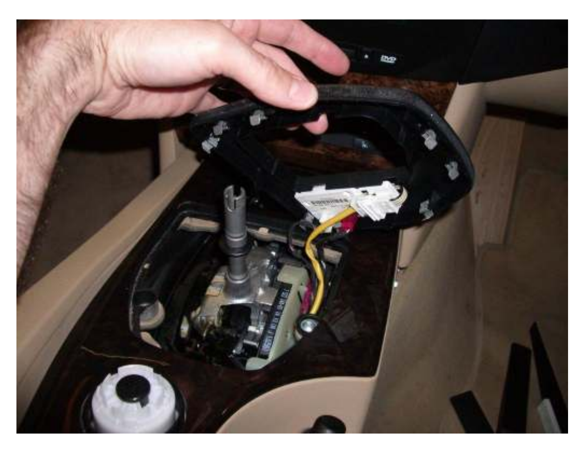
19. 2 screws holding wood trim down under gear surround (TIS says 3 but only 2 on my car). I believe the LCI (2007 onwards) has 2 extra screws at the front.