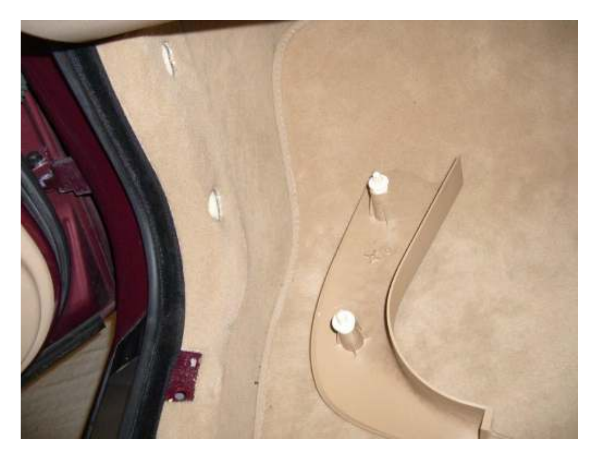
45. Remove glovebox (no need to remove lid but door does need to be open). 6 screws around front and two underneath - one near the tunnel and one under the carpet near the door opening.

44. Lever off side panel. 2 clips. Plastic wedges.