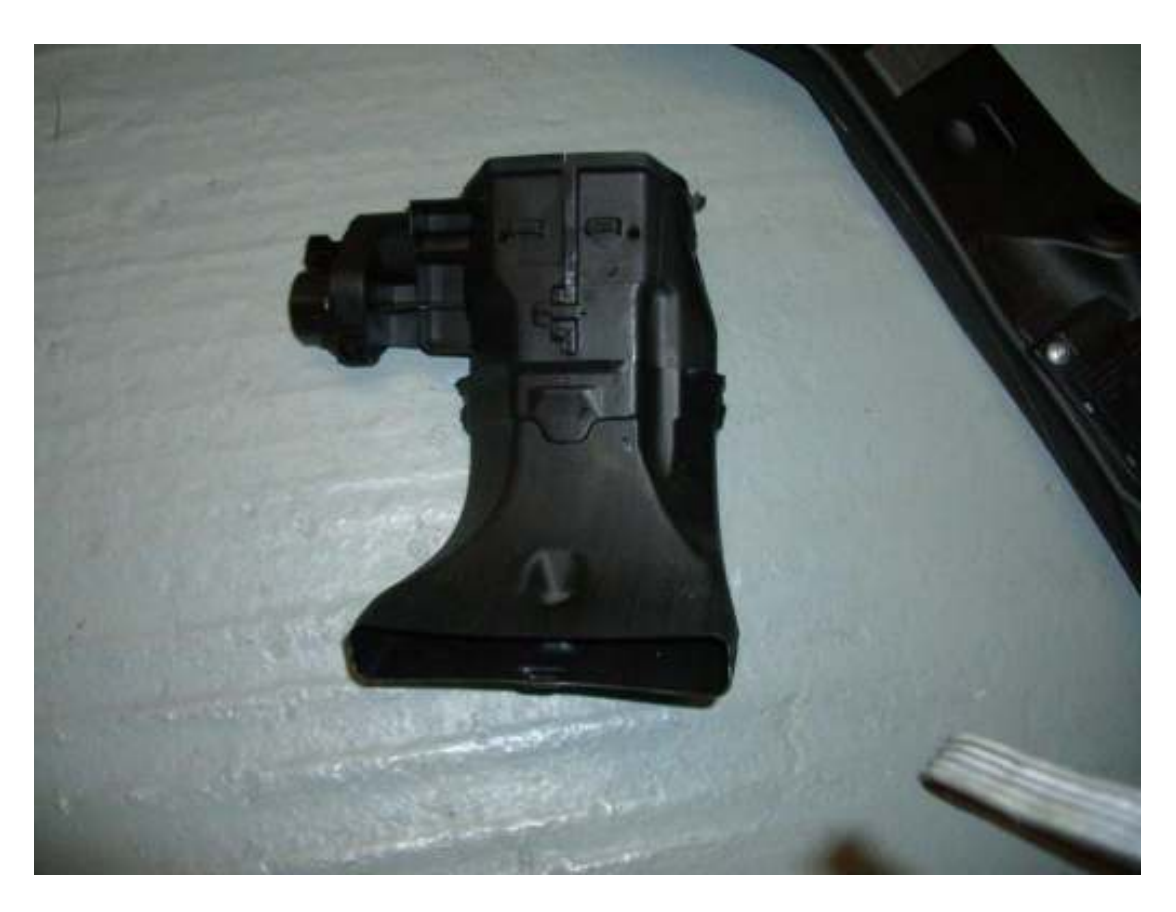
51. Left duct out. Wiggle out into the footwell.